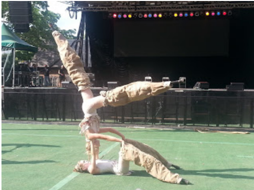
"The Carpetbag Brigade" performs at Global Family Day