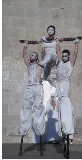
Nemcatocoa Teatro

next alfresco evening with the performing arts.